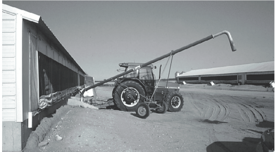
Figure 44-5. Agitation and pumping equipment for the deep pit manure storage under a pig-finishing barn.

A gitation or mixing of the manure before and during pumping contributes to odor and gas emissions... .