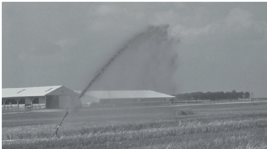
Figure 44-6. Spreading liquid manure with a traveling gun irrigation system.

produce large droplet sizes, installing drop nozzles on center pivot systems, and adding dilution water to the liquid manure before applying.