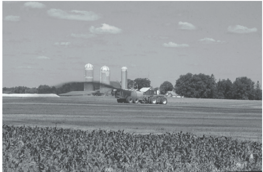
Figure 44-3. Surface application of liquid manure on cropland.