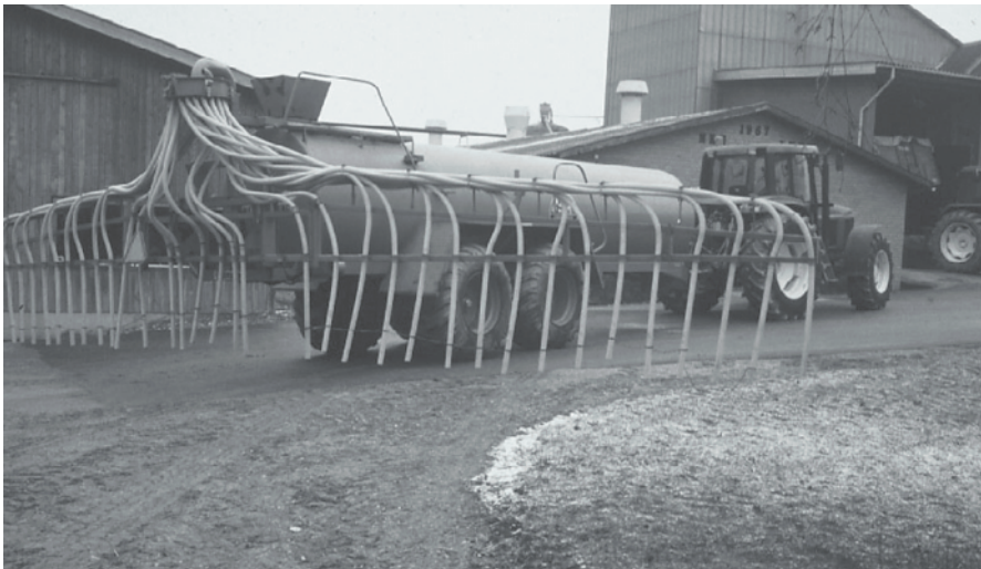
Figure 44-4. Drop hose liquid manure applicator.

Another method of application, used in northern European countries, is to simply place liquid manure on the surface through a series of drop hoses much like a sprayer hose or boom (Figure 44-4). This technique has been used to spread manure slurry (liquid manure from under barn pits) on tilled cropland and on growing crops (especially small grains), producing minimum odor and minimum potential runoff and/or erosion. The system has been used with manure tanks but could be adapted to drag hose technology on pastures or some crops such as forages. Adoption of this technology may be limited in the United States because of the prevalence of row crops and the difficulty of matching tanker tire size with rows and wheel spacing.