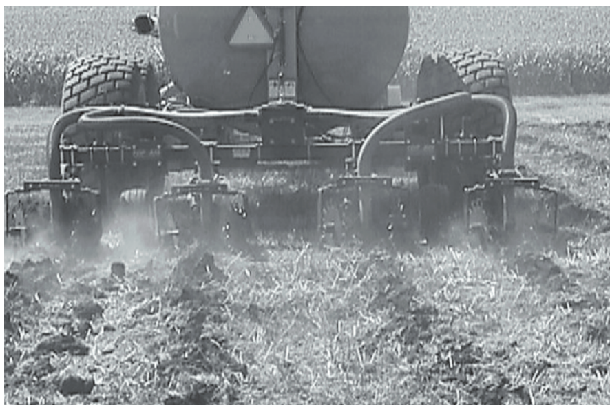
Figure 44-2. Injection of liquid manure into the soil.

Manure injection into the soil is the most effective way to reduce odor during the land application of untreated liquid manure (Figure 44-2). Table 44-1 shows odor dilution thresholds for various land application methods. One can see that the injection and the unmanured (control) methods have essentially the same odor units. The other common option is to simply