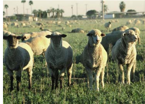
Figure 4. Sheep grazing irrigated land.