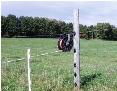
Figure 5. Electric psychological barrier fence.

fence. Electric fence is generally lower cost and is the most common choice (Figure 5). Non-electric fences should be used where escape would be very undesirable, animals could be crowded against the fence, or there is danger to humans, especially children (Figure 6).