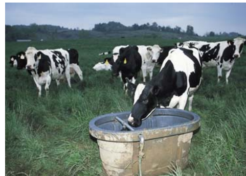
Figure 9. Dairy cows drinking from portable water tank in pasture.