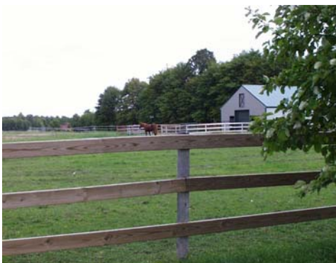
Figure 6. Board physical barrier fence.

The fence must be effective. If the animals escape, you do not have controlled grazing. Design your fence for 99% of your animals and sell the 1% who are chronic escapers. Two more important items: the fence must be fixable and low cost over its usable life. Cheap materials may result in a high-cost fence in the long run since the cost of a fence is \frac{1}{2} materials and \frac{1}{2} labor.