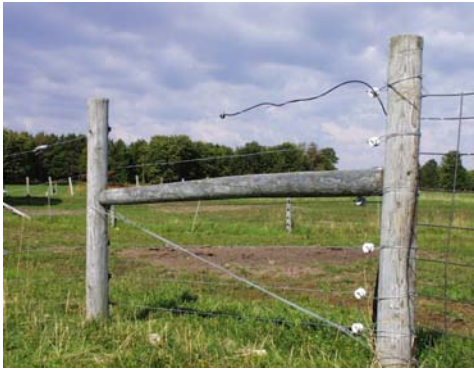
Figure 7. Well-built post assembly.

A good fence includes well-built corner and end posts. See Figure 7 for an example of good end post construction.