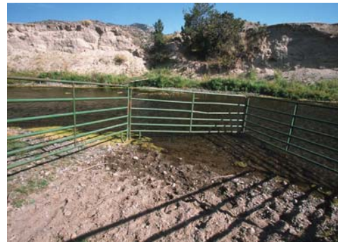
Figure 8. Stream access site for cattle.

via the new plastic pipe (Figure 9). The key is to monitor the streamside areas in your pasture to maintain a healthy ecosystem. (For more information about safeguarding the water on your farm, see the Small Farms fact sheet titled "Protecting the Water on Your Small Farm.")