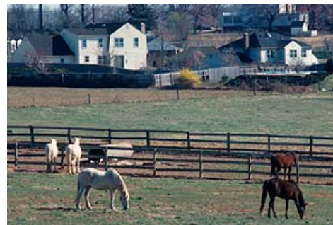
Figure 1. Horses getting exercise and feed.