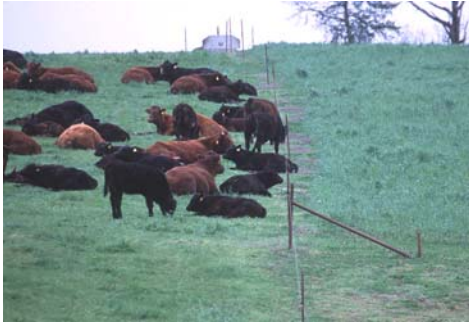
Figure 3. Beef cattle waiting to graze the next pasture.