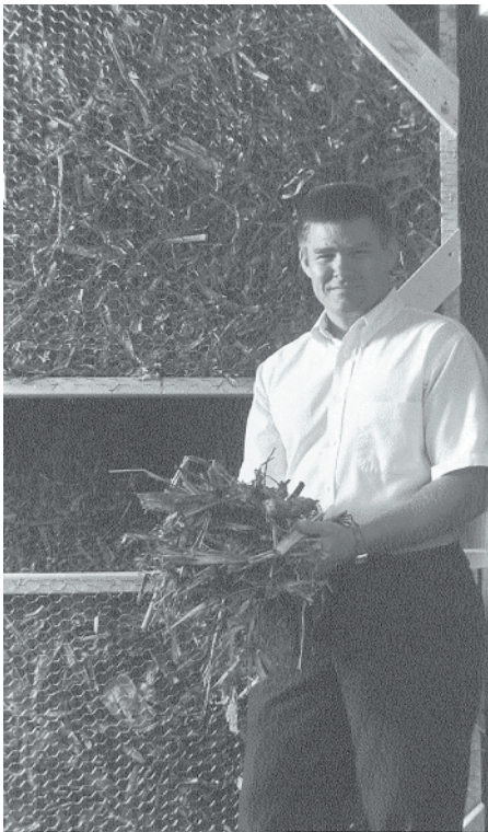
Figure 41-6. Biomass filter composed of sandwich panels of chopped cornstalks outside of swine nursery.

Researchers at Iowa State University have tested biomass filters as a means of removing odorous dust from swine buildings (Hoff et al. 1997a). Biomass filters use the principle that dust, if removed from the ventilation exhaust stream, will capture a large portion of the odors with it. Hoff et al. (1997b) were able to demonstrate a relationship between scrubbing dust and odors in controlled laboratory experiments and in a full-scale field trial. Using inexpensive material, a biomass filter removes odorous dust from the air stream. The biomass consists of either chopped cornstalks or corn cobs (Figure 41-6), but other materials can be used. Both odor and dust levels were significantly reduced: odor by 43% to 90% and dust by 52% to 83%. These reductions occurred with low resistance to airflow at cold weather ventilation rates.