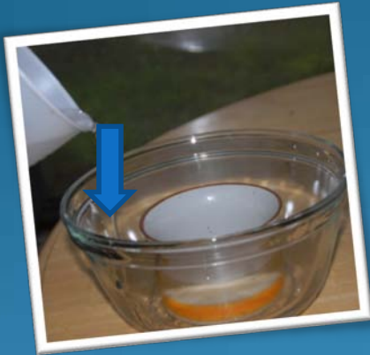
Step 1 and 2