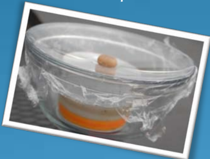
Step 3 and 4