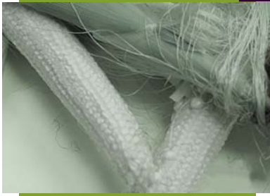
Ken Goddard Henry County Extension Agent

The picture above was taken in Henry County. From the road, the corn crop appeared to be in fair condition, but closer inspection revealed lack of ear development.