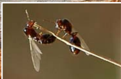
Figure 1. Two female red imported fire ant alates preparing to lift off for nuptial flight.

Much research has been done on the fire ant's biology, ecology, and control measures. However, few studies have been conducted on the phoretic arthropods associated with the red imported fire ant. Since relatively little information is known about the phoretic associates of this ant, a study was conducted by the authors to compile a list of species associated with the monogyne colonies of this ant in central Louisiana.