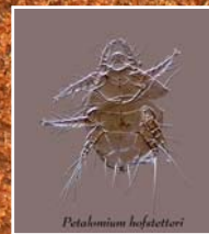
Figure 4. A newly described species, Petalonium hofstetteri , phoretic on Solenopsis invicta .