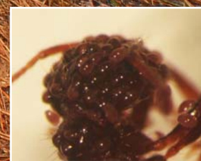
Figure 7. Head of a red imported fire ant loaded with phoretic Oplitis moseri .