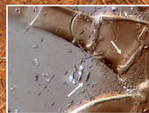
Figure 6. Hyperphoretic spores found to be associated with phoretic mites of Solenopsis invicta .