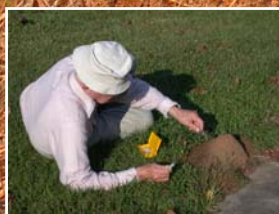
Figure 2. Collecting fire ant alates as they prepare to fly.

Twenty nests were marked in a suburban yard in Pineville, Louisiana. Nests were checked daily between the hours of 12 and 3 p.m., for a 16-month period, starting in May, 2004. Alates were collected as the winged females and males prepared to fly (Figure 2). Female and male alates were placed into separate vials of ethanol at the time of collection. Arthropods collected phoretically on the ants were removed and mounted onto slides in Berlese medium. Arthropods remaining in the sediments were also mounted, identified, and recorded.